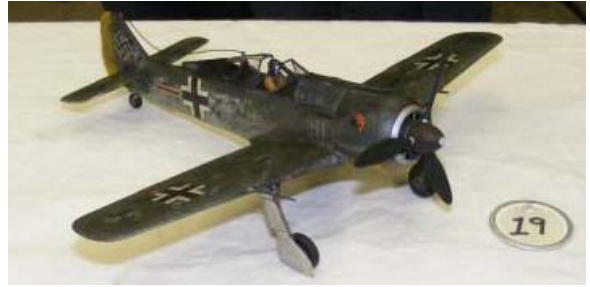
Roy Cunningham's Tamiya 1/72 FW-190.