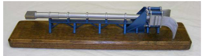
John Geigle's 1/10 scale resin model of a modern US Navy kinetic force electro-magnetic gun. This represents an experimental naval weapon that propels a non-explosive kinetic energy dart to kill ships instead of chemically propelled explosive warheads.