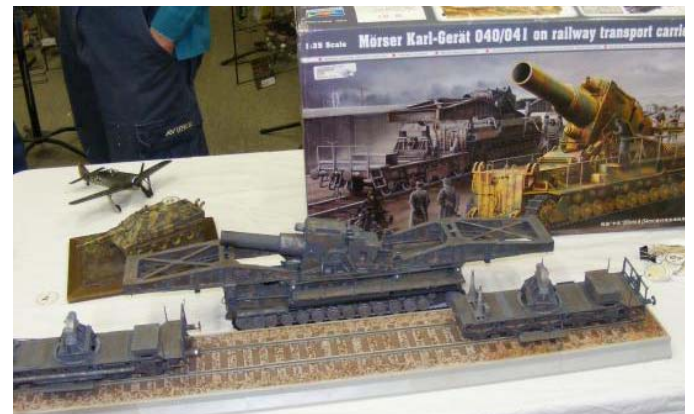
Bronze Winner: Lyndell Burris' Trumpeter 1/35 huge Karl Morser German railway gun and transport carrier.