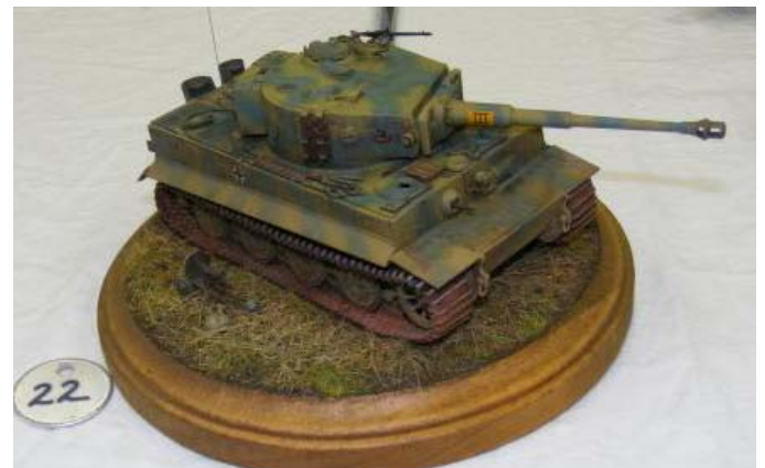
Silver Winner: Jon Lange's Skybow 1/48 Tiger tank.