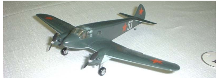
Russian transport plane (typeand brand unknown)