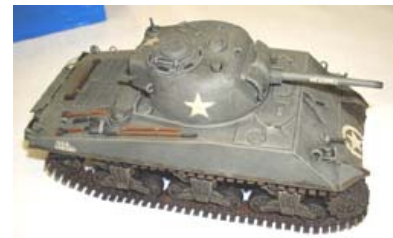
Adam Cox was Sherman "happy" this month with 4 of them on the table. These 3 models include 2 Tamiya kits (the M4A3 and M4) and an Italeri (M4A1). Looks like the US production line during WW II !!