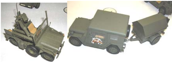
Junior modeler Cory Gilmore brought in this pair of 1/35 th Academy MUTTs. Once with a TOW launcher and the other sporting a trailer, but both very cleanly built !