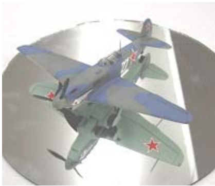
Brian Yee has been turning out a lot of Russian aircraft lately. This fine looking Yak-9 is the 1/72 nd Encore kit.