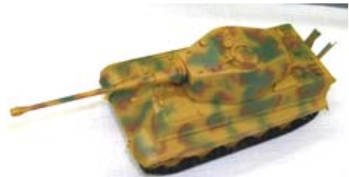
Brian Yee is again venturing into the 1/144 th armor realm with this in process RoG Tiger II. The ambush camo scheme is nearly complete and then time for some dirt ! Looking forward to seeing the finished product !